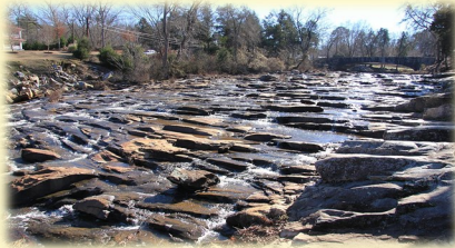
Indian Springs State Park, Flovilla, GA